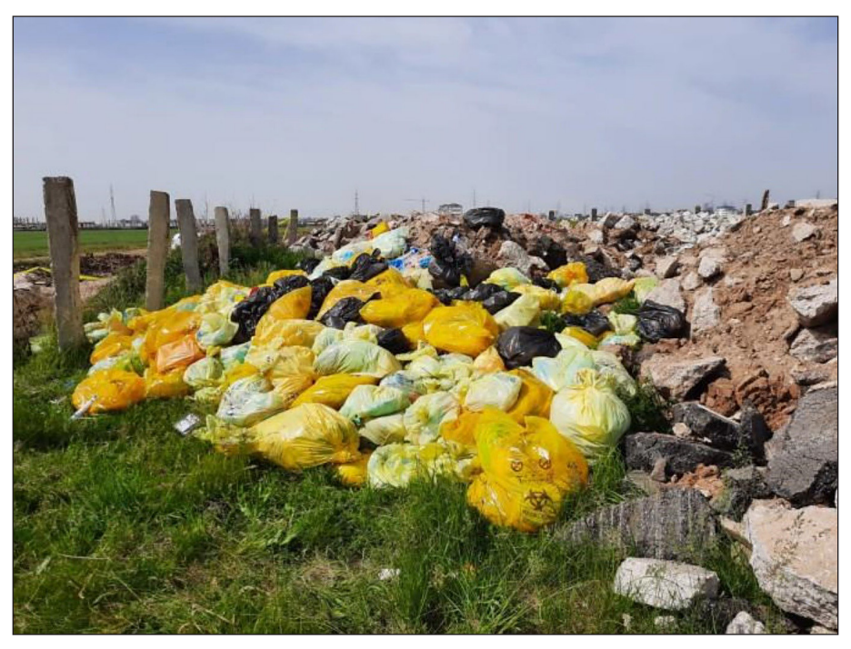
Figure 2. Illegal dumping of medical and biological waste in Dobroiesti commune, Romania, in 2020

the recommendations of STANAG 2982 "Essential field sanitary requirements" – compliance with sanitary and hygienic requirements in the field).